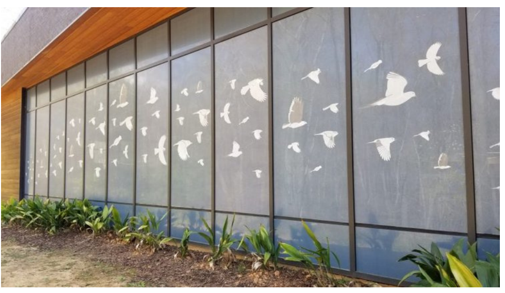
CollidEscape window film installed at Richland Library Ballentine prevents bird strikes, and it is transparent from indoors!

This new effort to conserve and enjoy SC's aquatic resources allows new or experienced anglers an opportunity to help keep our waterways clean and litter-free, use best fishing practices such as catch and release, and connect with friends and family in our beautiful freshwater and saltwater habitats. This virtual event runs from June 1 to August 31, 2022 with prizes awarded to top participants. Go to scwf.org/ plishing to register!