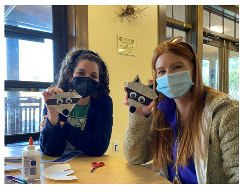
Project WILD teacher training at Riverbanks Zoo.