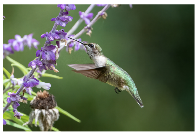
2021 Photo Contest, "Backyard Habitat" winner: Hummingbird on Mexican Salvia, by Charles Rucinski.