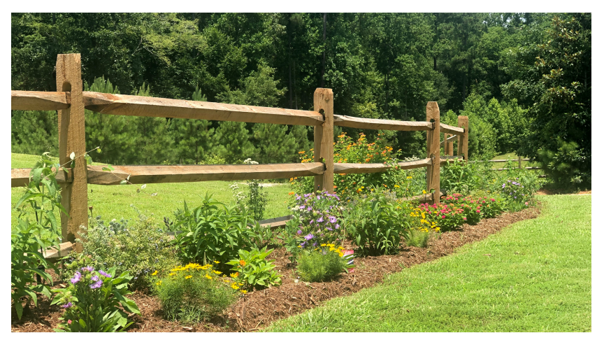
Thanks to a grant from Dominion Energy, we installed a 560-sq ft pollinator garden at Chapin Town Hall. The garden, which consists of mostly native plants, supports a large number of birds, pollinators, and reptiles in its first year!

Visit scwf.org/habitat to learn how to create a certified habitat in your own backyard to support wildlife!