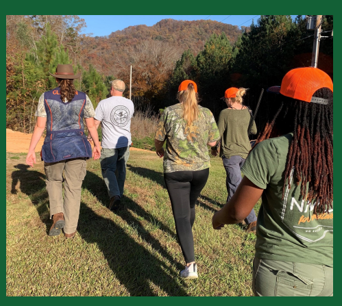
Academics Afield students at Jocassee Gorges on their first hunt.

This new SCWF program introduces students to hunting by pairing them with experienced student hunters, who take an active role in mentoring their peers. By participating in shooting sports and student-mentored hunts, Academics Afield demonstrates the connection between hunting and conservation. Students learn how hunters help biologists manage wildlife populations, and the ways that license fees support conservation.