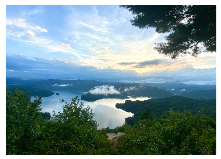
SCWF works at the state and federal levels to protect habitat across the state, including this breathtaking wilderness at Lake Jocassee.

The SC Conservation Enhancement Act would restore a dedicated stream of funding derived from a portion